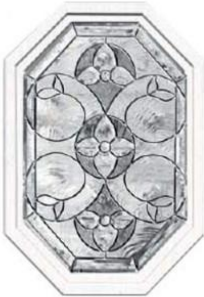
Y ELOCT 2028

This elegant design with a combination of clear bevels, clear textured glass and grey waterglass evokes an old world charm.