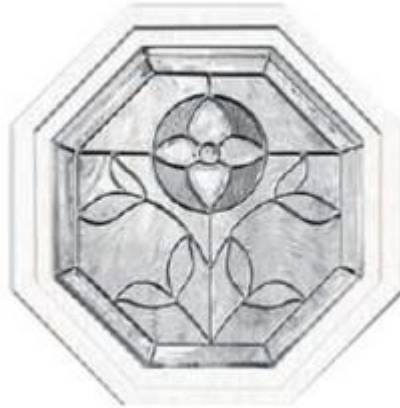
Y OCT 2020