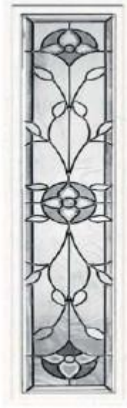
Y SL 1264