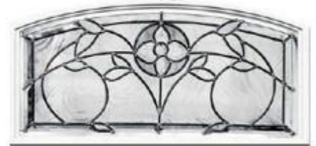
Y SEG 2614