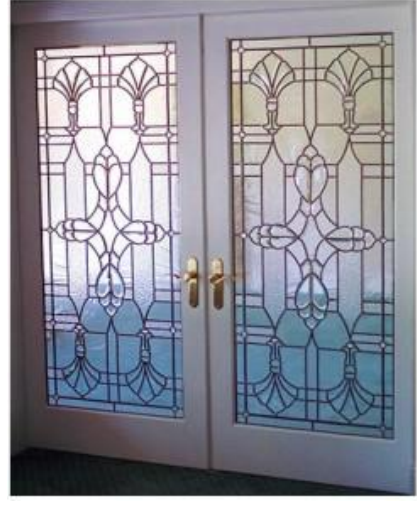
Various glass types are incorporated with traditional stained glass to create a truly unique piece.

This flowing design on exterior doors creates an unforgettable first impression. The pattern continues to flow on a window.