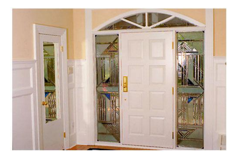
Elegant visual textures create a stunning sidelite and transom combination.