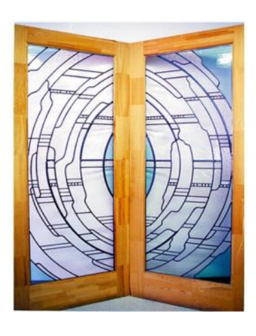
Bands of textured glass, with varying thicknesses of lead can be combined to form a refined contemporary entrance.