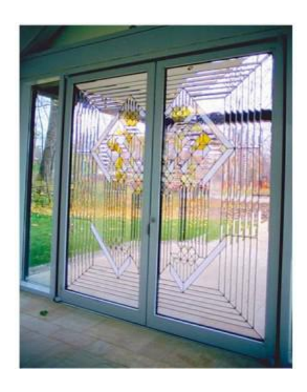
State of the art modernism abounds in these geometrically patterned glass doors.